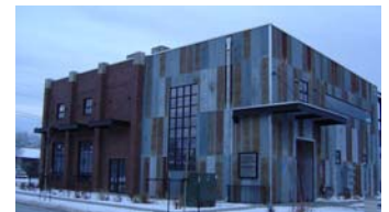
Brown Warehouse 2003 Winner New Commercial