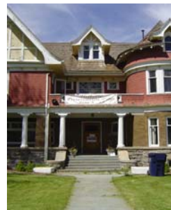
TB Story Mansion