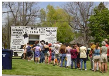
Residents wait in line during the Ice Cream Social..